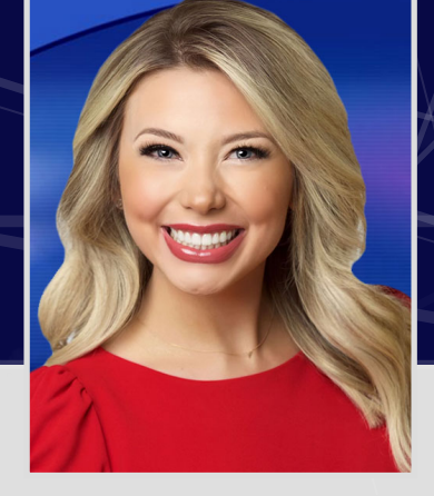
National Association of Hispanic Journalists Member